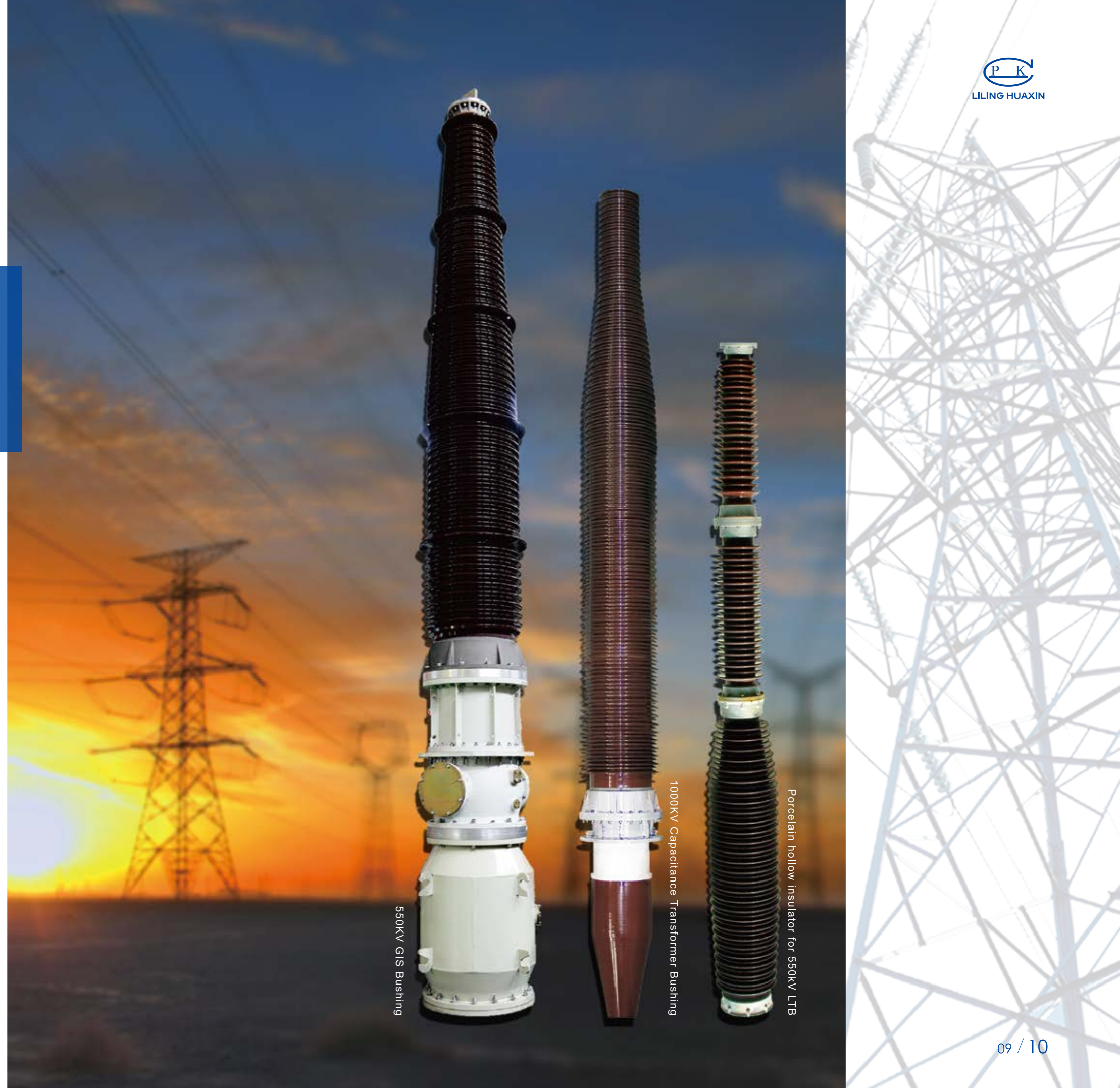
550KV GIS Bushing

Huaxin inlaid capacitor bushings totally meet the IEC standard of IEC 60137-2008 and JB/T 11052-2010 (Technical conditions of inlaid capacitor bushing).